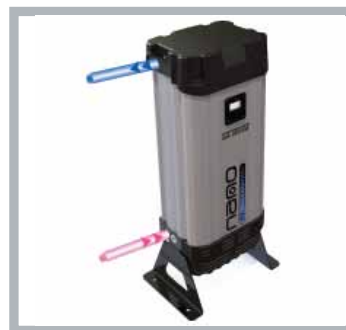
flexible piping & installation options