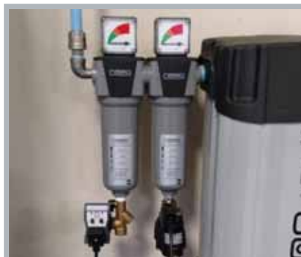
performance validated nano F 1 filtration