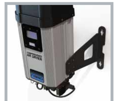
mount on the floor or the wall