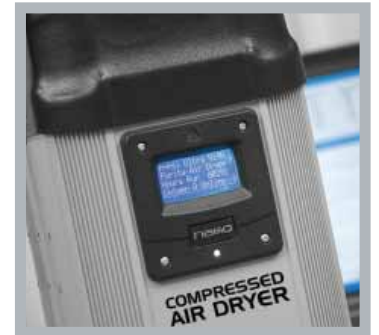
PLC controls with clear text display