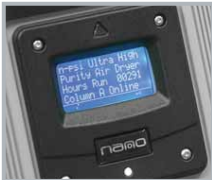
PLC controller with clear text display