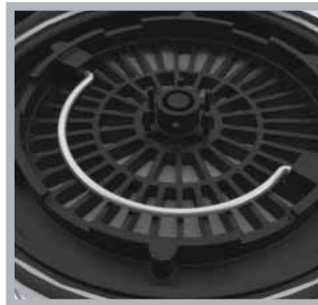
unique patented cartridge design

The dryer is controlled by a PLC which periodically switches the solenoid valves, reversing the function of each column and therefore ensuring the continuous supply of dry air.