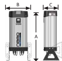
NDL 010 to NDL 130